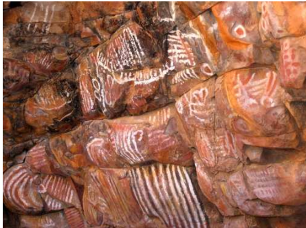
Malki painting site on Angepena is 16000 years old

Angepena has been Adnyamathanha land since time began and it is vital to their spiritual and cultural survival.